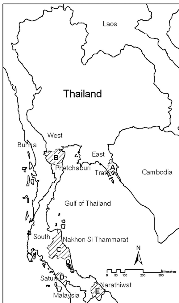
Fig. 1. The five locations in Thailand where the farmed edible bird's nests (EBN) samples were collected.

Elemental analysis method in this experiment was modified from Naozuka et al. (2011). Sample masses at about 250 \pm 0.0005 mg were digested using a diluted oxidant mixture (2 mL HNO 3 + 1 mL H 2 O 2 + 3 mL H 2 O). The temperature was increased gradually, starting from 50 °C and increasing up to 200–220 °C. The digestion was completed in about 45–50 min as indicated by the appearance of a transparent liquid mixture. The mixtures were left to cool down and the contents of the crucibles were transferred to 50 mL volumetric flasks. The volumes of the contents were made to 50 mL with 2% HNO 3 solution. The wet digested solutions were